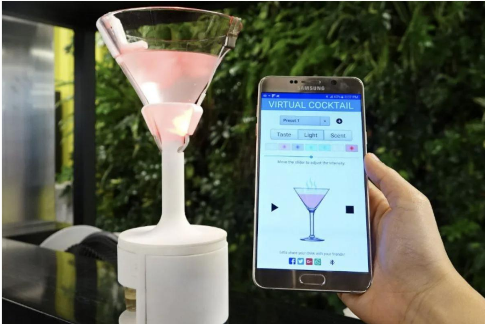
The vocktail contains parts that can alter the color, taste and smell of your cocktail. An app that accompanies the device helps you alter these characteristics. [-] MM 17/DIGITAL TRENDS/RANASINGHE